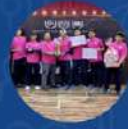
Hunch Hunt Challenge 2024 Edition