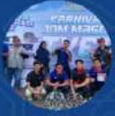
Mini Carnival "Jom Masuk TVET"